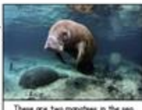
These are two manatees in the sea.

Some people call them gentle beasts because of their sheer size, yet delicate movement. Manatees can grow up to twelve feet long and weigh up to 1,800 pounds. They can live for up to sixty years in the wild but are endangered now. They face dangers such as getting caught in fishing nets or even getting too close to boat propellers.