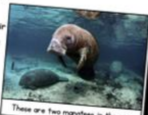
These are two manatees in the sea.

Some people call them gentle beasts because of their sheer size, yet delicate movement. Manatees can grow up to twelve feet long and weigh up to 1,800 pounds. They can live for up to sixty years in the wild but are endangered now. They face dangers such as getting caught in fishing nets or even getting too close to boat propellers.